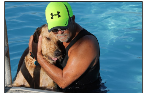
It was hard to tell who had the best time at the pool, the dogs or their humans.

Thanks to a partnership between the Beatrice Humane Society and the city of Beatrice, the first "Doggie Dip" was a howling success. The pool party for pooches raised over $800 in admission fees and donations. All proceeds went to the shelter for the care of the dogs and cats.